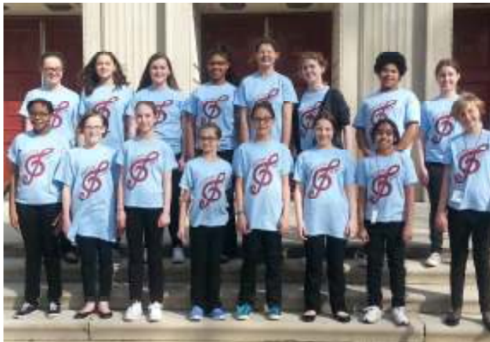
Above: WSGC Singers at the Piedmont Festival; Below: 2017 PICCF Info