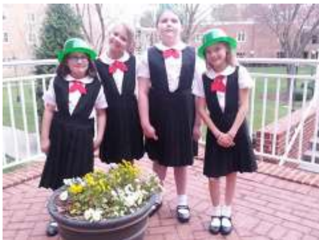
Above: UPBEAT! Choir singers celebrate St. Patrick’s Day at Salemtowne Retirement Center with a special concert.

Our advanced choir, Encore, will be performing with the Piedmont Chamber Singers in a Joint Concert on Saturday, April 23, at 7:30 pm. It will include Randall Thompson’s “Testament of Freedom” and other patriotic songs. The concert will be held at Ardmore Baptist Church and an admission is charged. —for more info: www.piedmontchambersingers.org